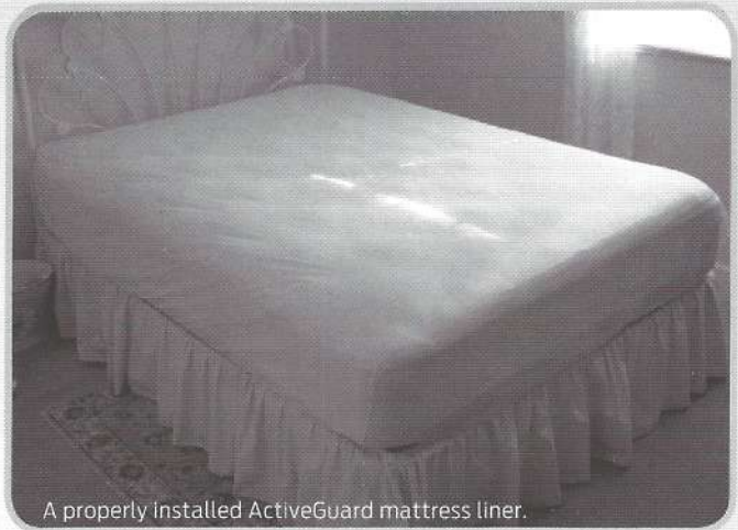
A properly installed ActiveGuard mattress liner.