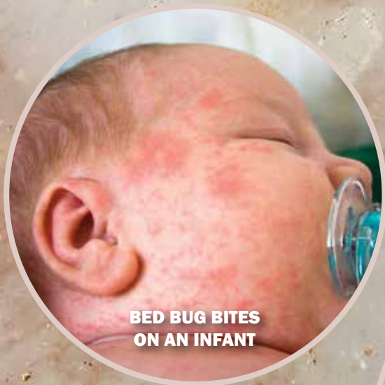
BED BUG BITES ON AN INFANT

Blood-feeding insects can cause discomfort and disease in the hosts they parasitize, and bed bugs are no exception. Bed bugs inflict numerous negative impacts upon human hosts.