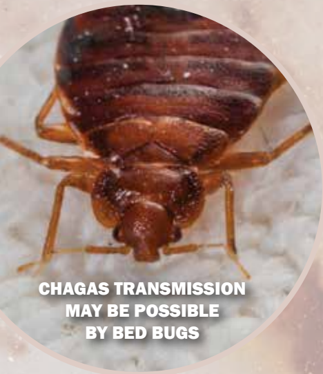
CHAGAS TRANSMISSION MAY BE POSSIBLE BY BED BUGS