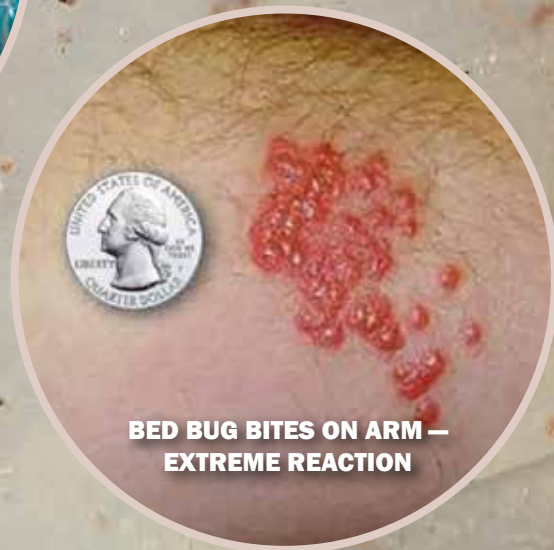
BED BUG BITES ON ARM — EXTREME REACTION