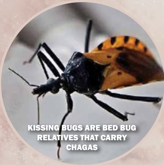
KISSING BUGS ARE BED BUG RELATIVES THAT CARRY CHAGAS