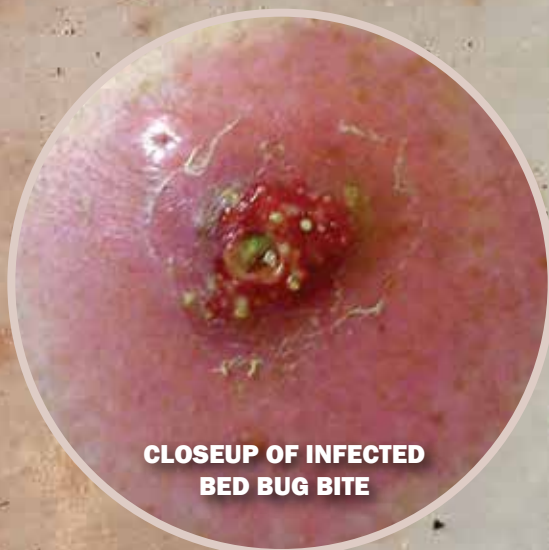
CLOSEUP OF INFECTED BED BUG BITE